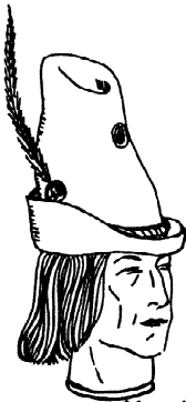
man's sugar-loaf hat with feather, jewels and cord-15th C.