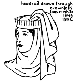
headrail drawn through or wimple's toque-white linen 13th C.