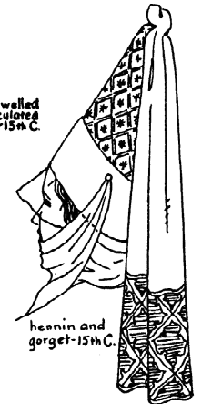
hennin and gorget-15th C.