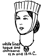
white linen toque and chinband 12th and 13th C.