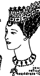
jeweled reticulated headdress-15th C.