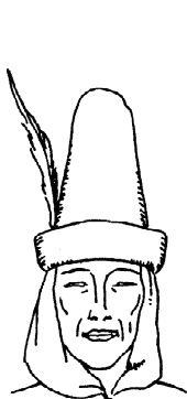
sugar-loaf hat worn over hood- 14th C.