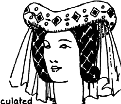
reticulated headdress-gold braid over crimson silk-stuffed roll with jewels-14th C.