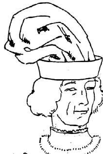
15th C. man's velvet hat