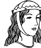
gold crown- white linen cap and chinband- 12th C.