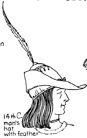
14th C. man's hat with feather