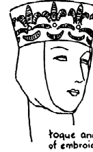
13th C. toque and chinband of embroidered linen