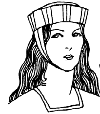
13th C. chinband & toque of white linen folds