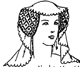
reticulated headdress- wimple over golden net caul- 15th C.