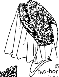
15th C. two-horned hennin