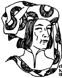
chaperon turban- 15th C.