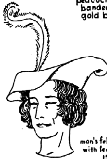
man's felt hat with feather- 15th C.