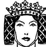
cylindrical caul of reticulated headdress-14th C.