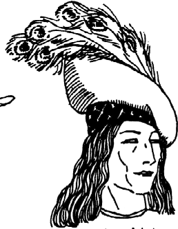
man's white felt hat- peacock feathers-red bandeau crossed with gold braid 15th C.